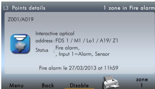
Details of a point