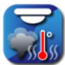
Combined detector (smoke and temperature)

The presence of pictures connected to information helps to recognize immediately the device interested: